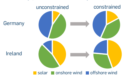
Fig. 4: Technology-specific shares of invested renewable energy in Germany and Ireland for 2030. Left: Onshore wind potential only constrained by technical and geographical constraints. Right: Onshore wind potential also constrained based on local public's acceptance.